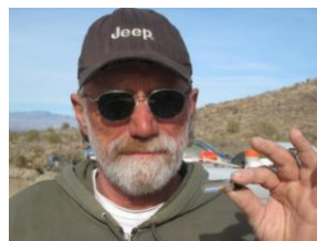
DAN FINDS A NICE NUGGET