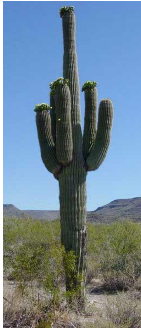
Mature five armed Saguaro cactus in bloom in late May.