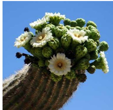
Saguaro cactus blossoms

This is our largest cactus in the United States. The flower of this cactus is the state flower of Arizona.