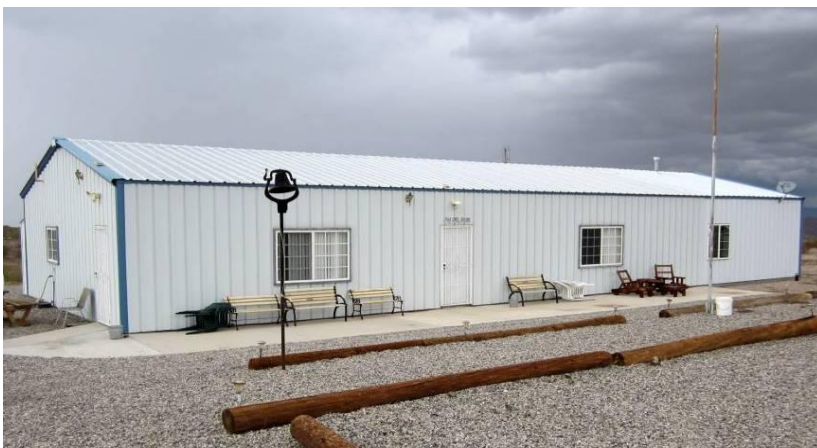
Fran Lowell Building for Meetings and Activities