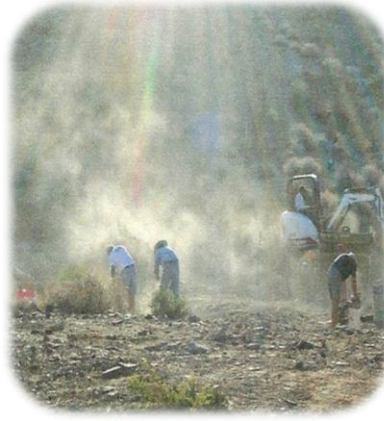
"End of Rainbow" A Common Dig