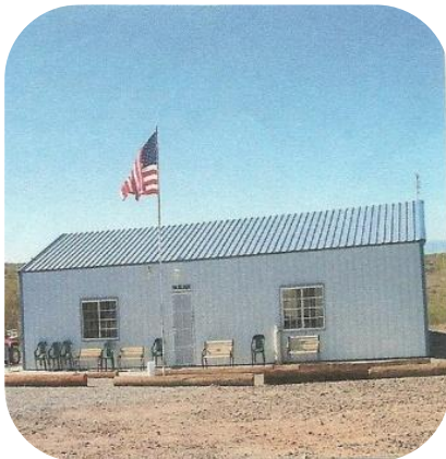
The Fran Lowell Building For Meetings and Activities