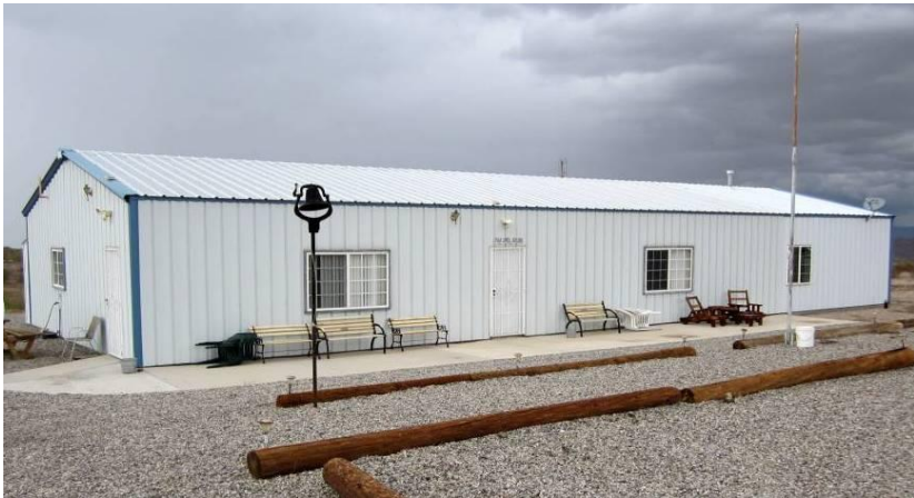
Fran Lowell Building for Meetings and Activities