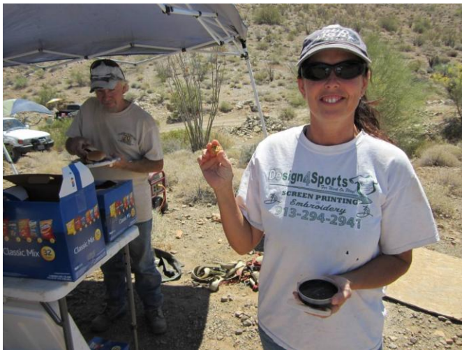
This little beauty was found at the common dig, it is about 1¼ inch in diameter WOW!