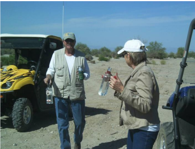
Your president trying to jumpstart his pacemaker.