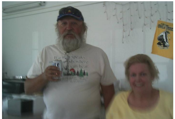
Our club Treasurer and his wife limbering up to balance the books.