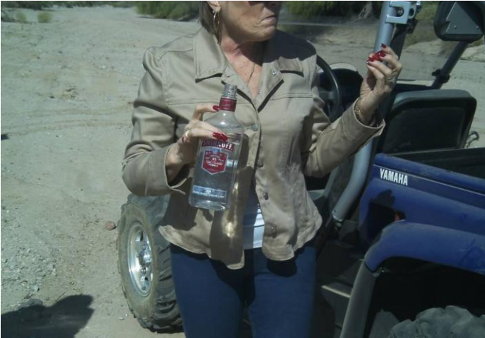
The presidents' wife enjoying an adult beverage for breakfast.